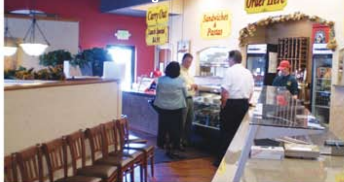
Fast Casual Ordering

96,493 residents are within a 5-mile radius. Plus 31,620 daytime population at Fort Carson with 18,500+ active duty.