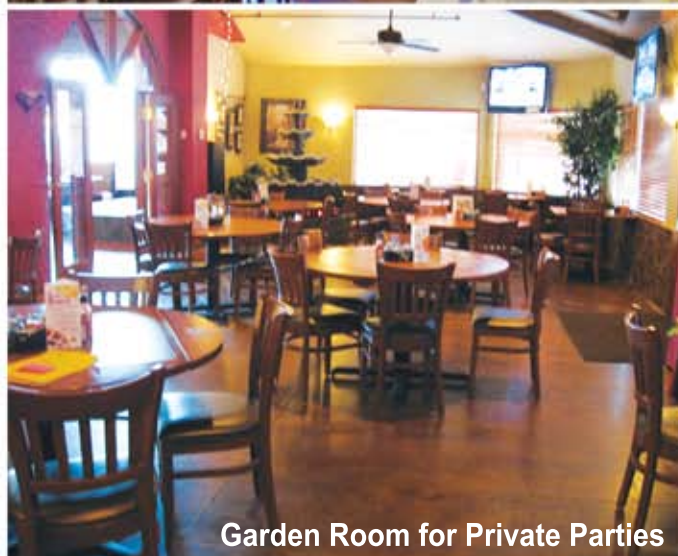
Garden Room for Private Parties