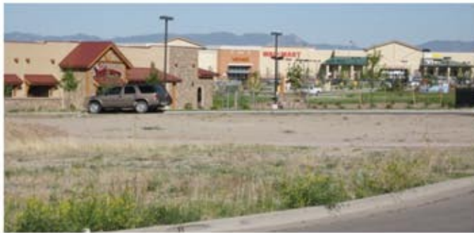
Picture of east corner of the lot with Wal-Mart Center a block to the west and new restaurant in the foreground.